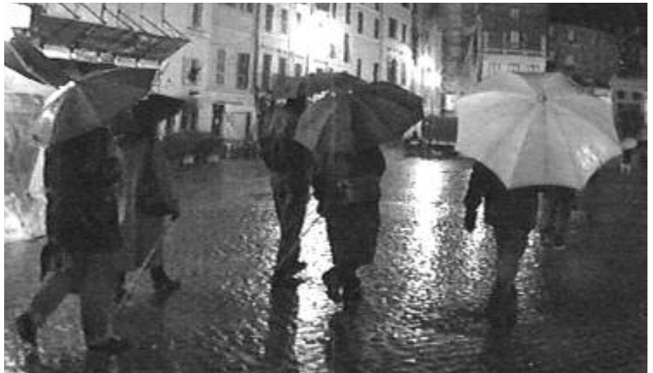
Rain before dawn, February 17

Later in the day there were films about Bruno, pop groups, and more